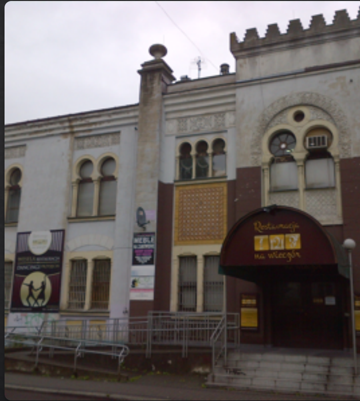
Mikveh – now Nightclub: Poland/Slovak border