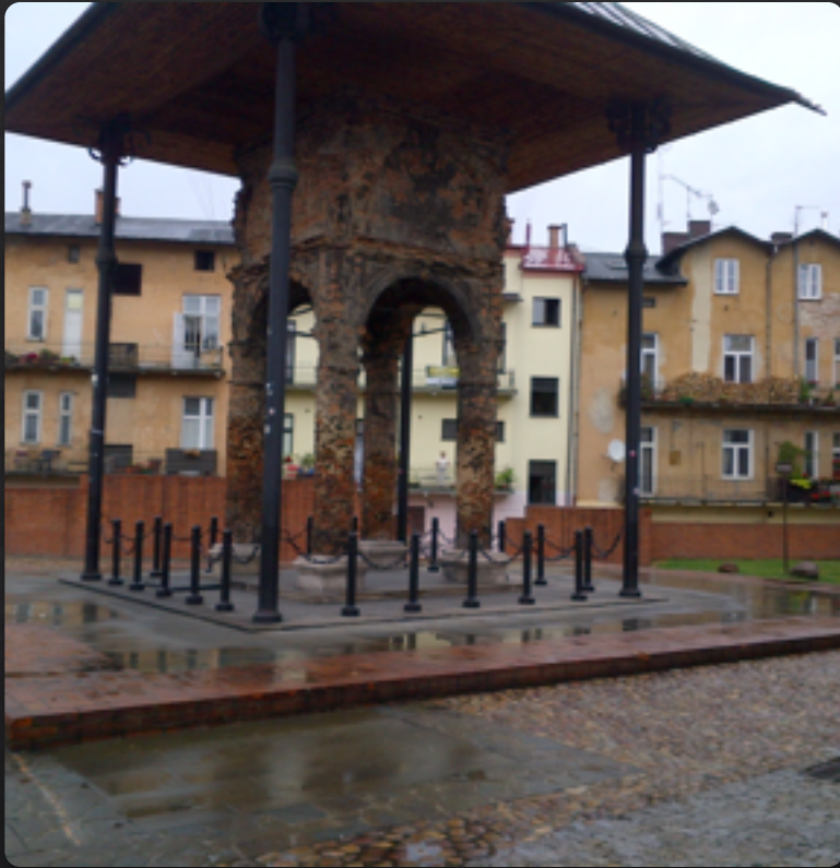
Bima – Tarnow, Poland