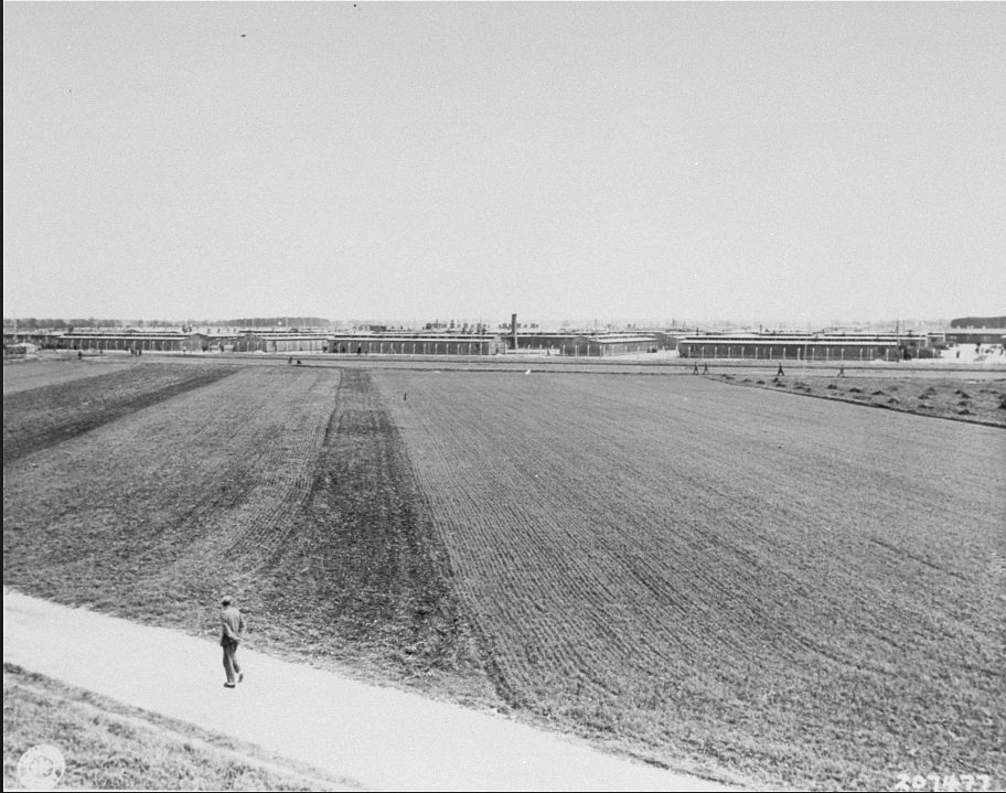
Dachau after liberation – USHMM, National Archives, College Park