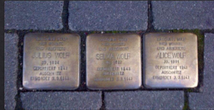
Stolpersteine in Saarland