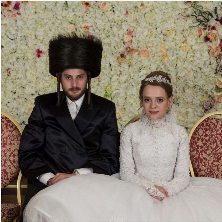
Unorthodox, Netflix Series