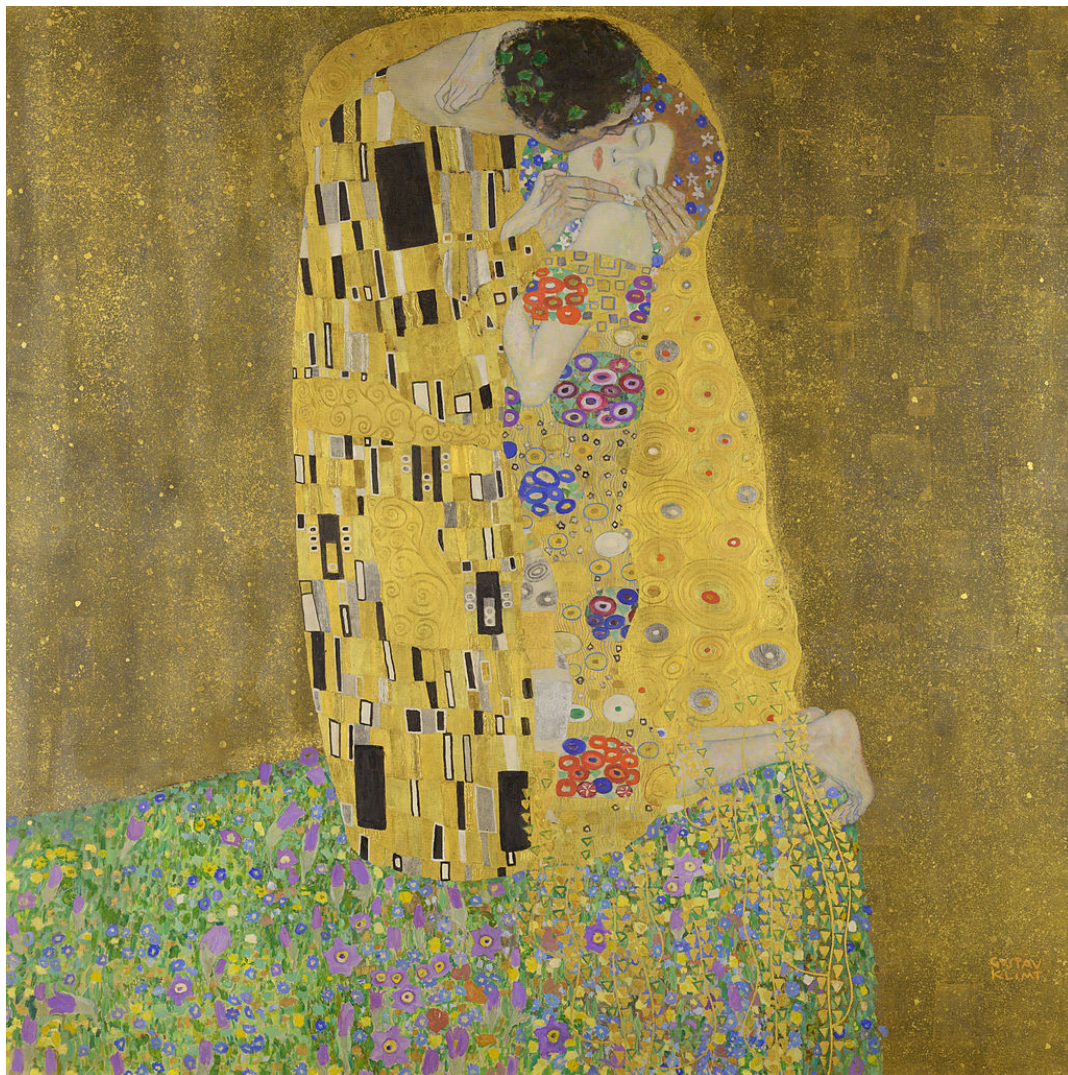
Gustav Klimt, The Kiss

Sometimes the girl is very delicate, pious and modest, and then the man feels bad and he does not reach (sexual) satisfaction. He feels that he is evil and uncouth and then he gets angry, nervous, and tense. Finally, he pours out his wrath on his wife without really knowing what he is doing... Many women cannot understand that a student of Torah [like their yeshiva husband] can be such a man of desires. But she should not be upset and she should not give him a sense that he is not normal. After all the Talmud reports what Rav Hisda taught his daughters].”