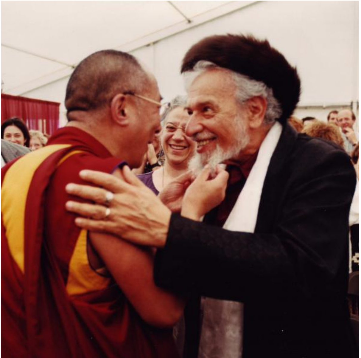
Reb Zalman Schachter-Shalomi (1924–2014)