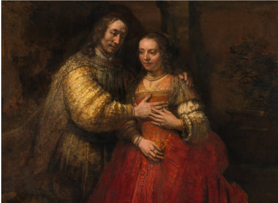
Rembrandt, The Jewish Bride